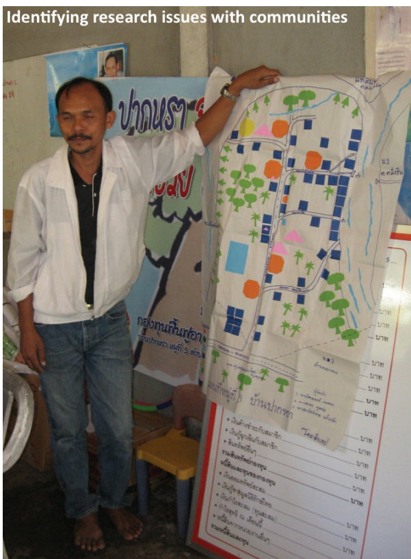
Identifying research issues with communities

Through its Aqua Outreach Program (AOP) AIT is pursuing a unique research approach that is guided by a set of principles which are inspired by an ethos of cooperation between researchers