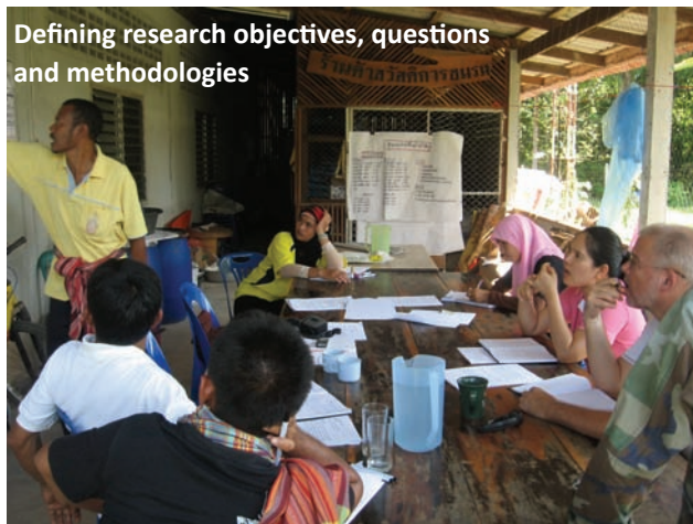
Defining research objectives, questions and methodologies

local knowledge and the capacities of local communities to contribute to the design and implementation of the research.